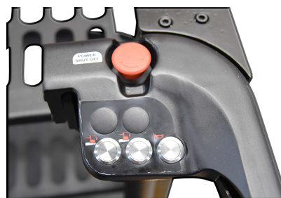
Right hand controls