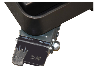
Rear locking swivel casters